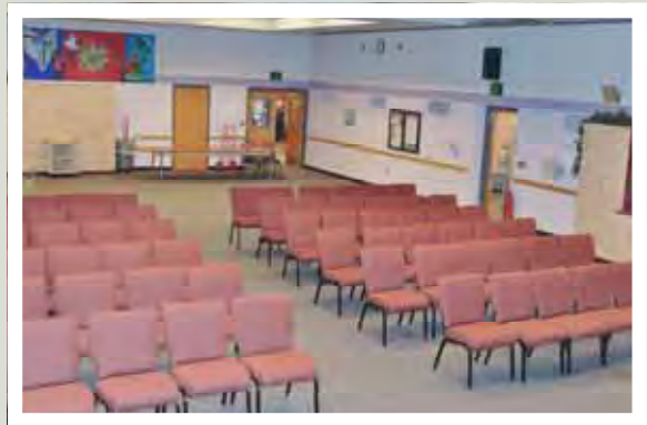
Minnesota Valley Room Theatre Style