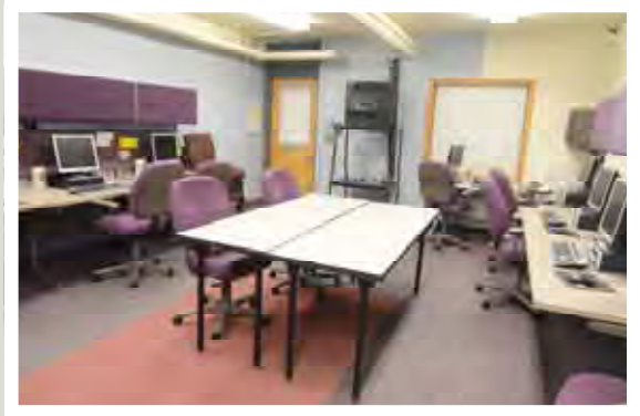
Computer Lab 7 stations