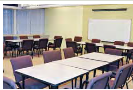
Room 110 Capacity: 45